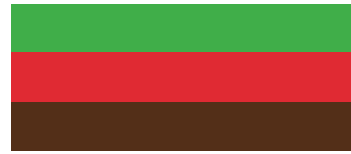
Royal New Zealand Armoured Corps