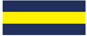
6th Hauraki Company, 3/6 RNZIR