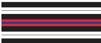
New Zealand Army Legal Service