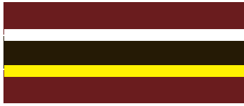
7th Wellington (City of Wellington's Own) and Hawke's Bay Company, 5/7 RNZIR