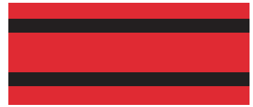
The Corps of Royal New Zealand Engineers