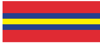
Royal Regiment of New Zealand Artillery