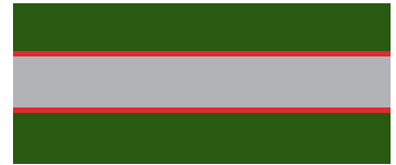
New Zealand Intelligence Corps