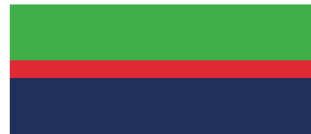
Royal New Zealand Dental Corps