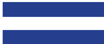
The Corps of Royal New Zealand Military Police