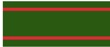
The Royal New Zealand Infantry Regiment