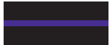
Royal New Zealand Chaplains Department