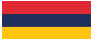
Royal New Zealand Army Medical Corps