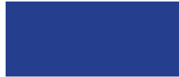
The New Zealand Special Air Service