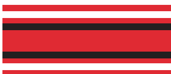
Royal New Zealand Nursing Corps