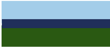
The Royal New Zealand Corps of Signals