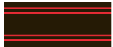
New Zealand Army Physical Training Corps